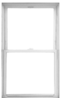
24" x 36" Insulated Window