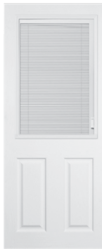
#5. Half Lite Blinds