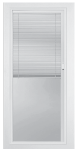
#9. Full-Lite Blinds