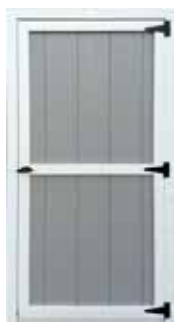
36" Single $479