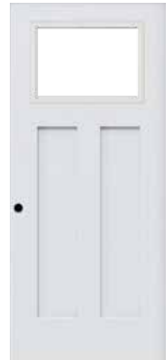
#12. Craftsman 1-Lite