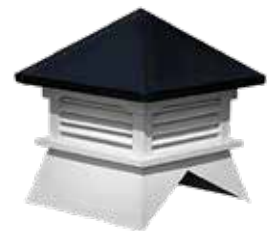
Louvered Straight Aluminum