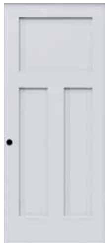
#14. Craftsman Solid