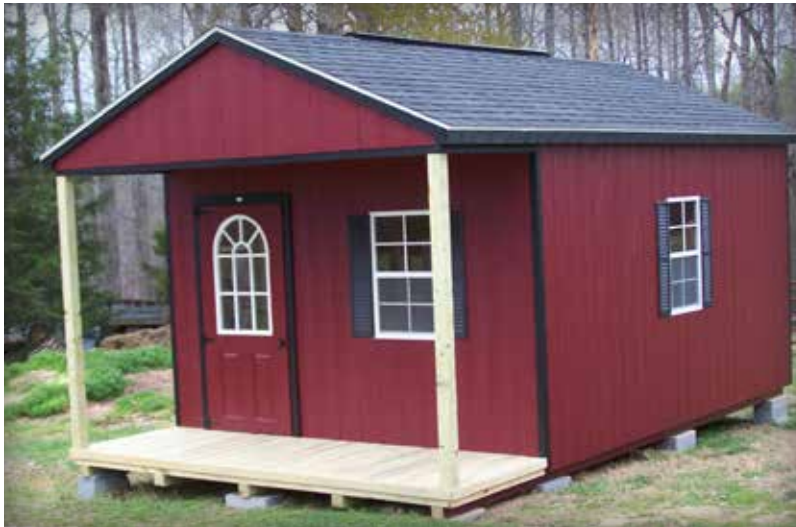
Porch shown with optional extra door and window