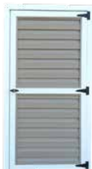
36" Single $534