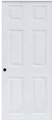
#11. 6-Panel Solid