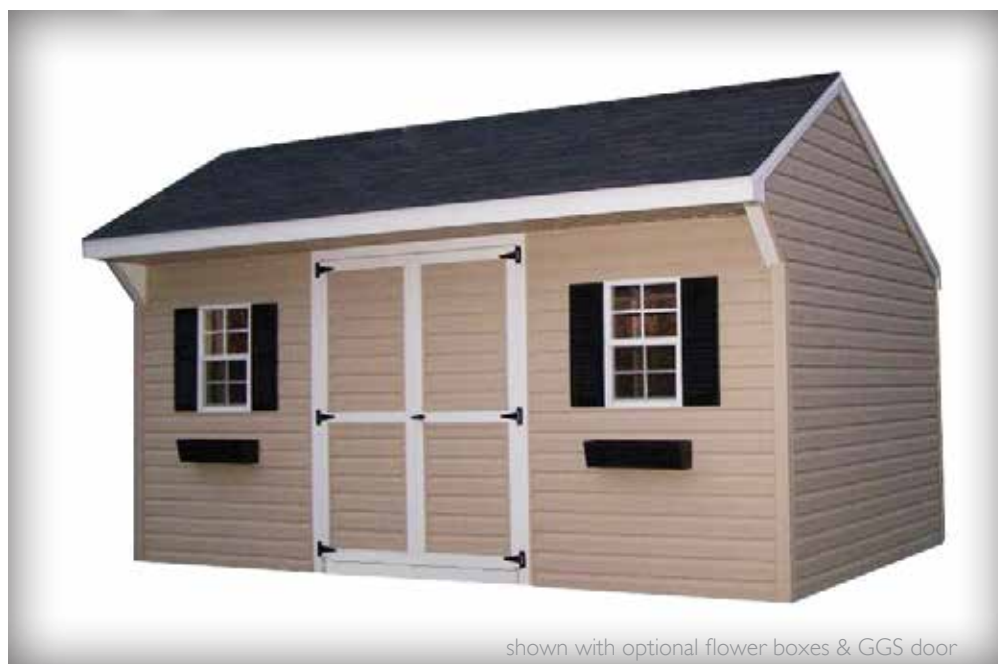
shown with optional flower boxes & GGS door