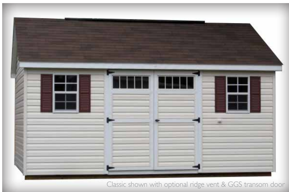
Classic shown with optional ridge vent & GGS transom door