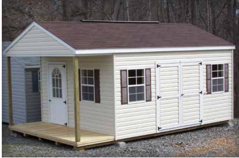
Porch shown with optional extra door and window