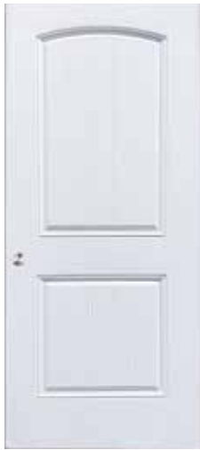
#1. Solid 2-Plank