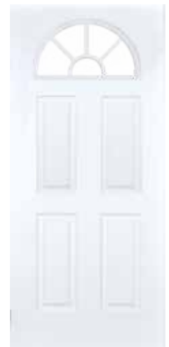
#15. Sunburst Half Moon