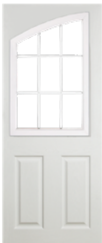
#16. 9-Lite Half Arch