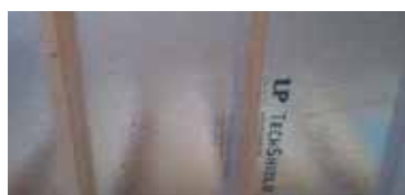
Tech-Shield Wall Sheathing