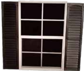
24" x 36"