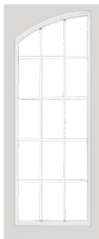
#17. 15-Lite Half Arch