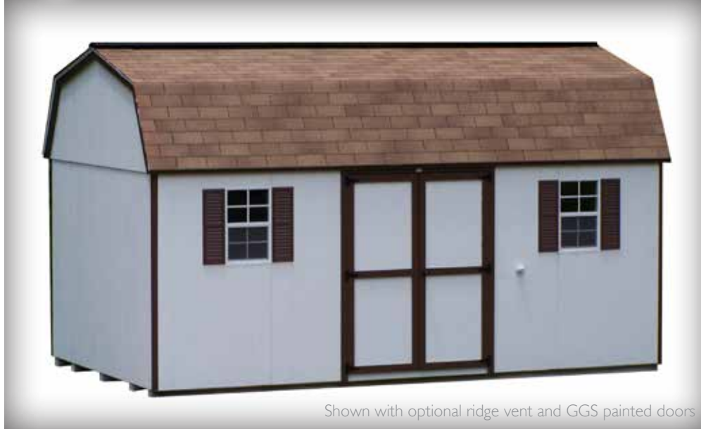
Shown with optional ridge vent and GGS painted doors