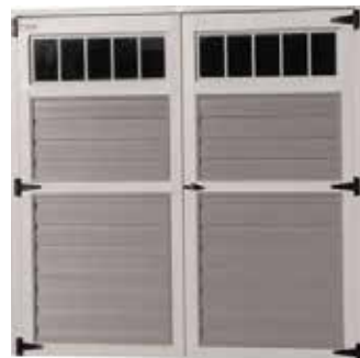
72" Double Transom $1,096