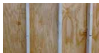
Plywood Wall Sheathing