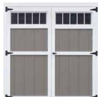
Double Transom 72".....$1,063