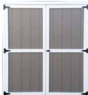
Double Solid 48".....$589 60".....$626 72".....$629