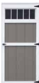
36" Transom $692