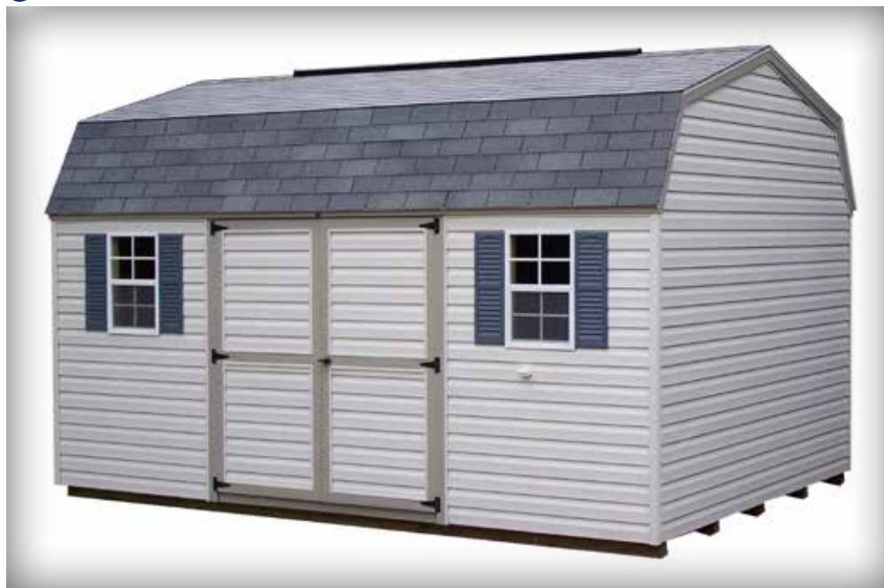
Shown with optional ridge vent & GGS door