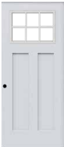
#13. Craftsman 6-Lite