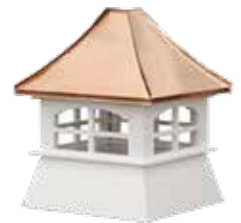
Window Concave Copper