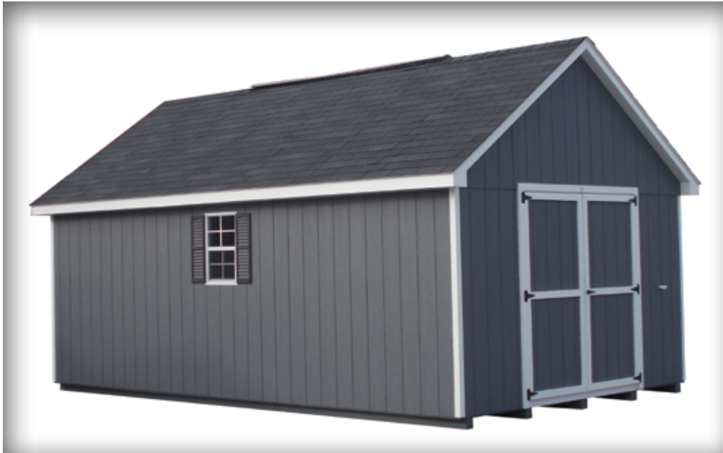
Shown with optional ridge vent and GGS painted doors