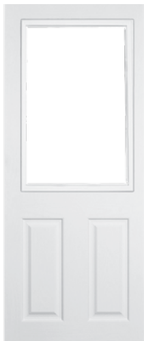
#4. Half Lite