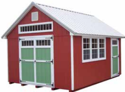
Window Transom 10"x72"