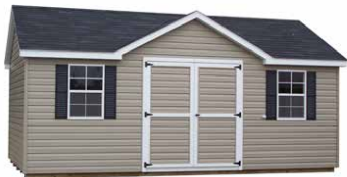
Gable Dormer on Classic Shed