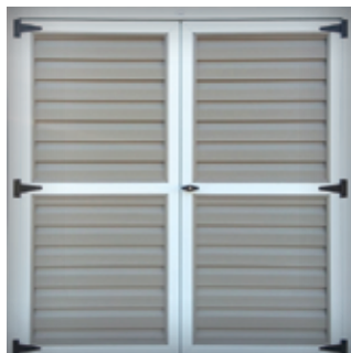
48" Double $680 60" Double $725 72" Double $734