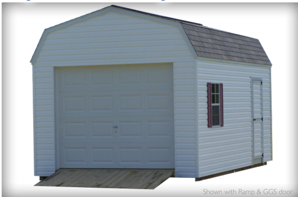
Shown with Ramp & GGS door