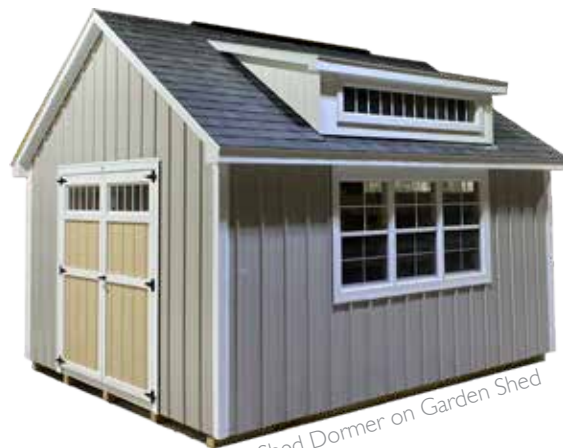
Shed Dormer on Garden Shed