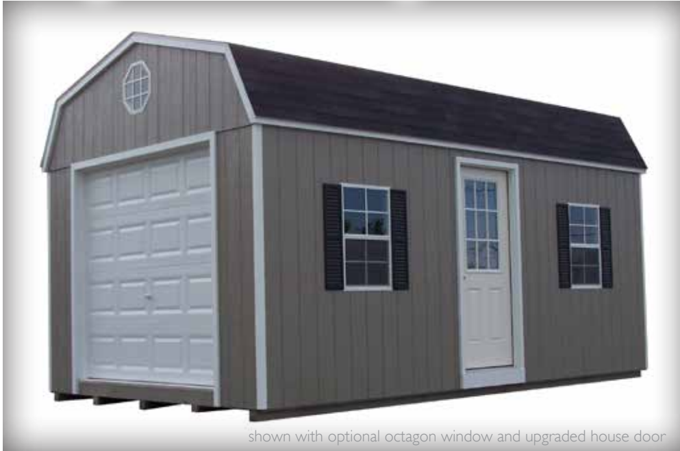
shown with optional octagon window and upgraded house door