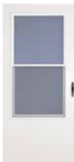
36" x 80" Storm Door. $310