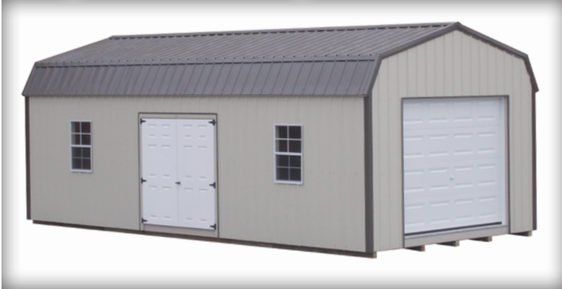
Shown with optional double doors