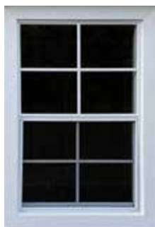
Trimmed Window (No Shutters)

* Windows located on Classic & Garden gable walls (for metal sheds only)..... add $138