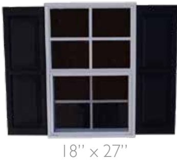
18" x 27"