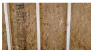
OSB Wall Sheathing