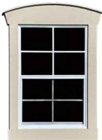
Window Trim Package (painted) Royal 24'x36"