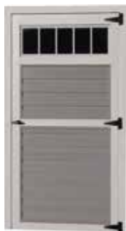
36" Single Transom $730